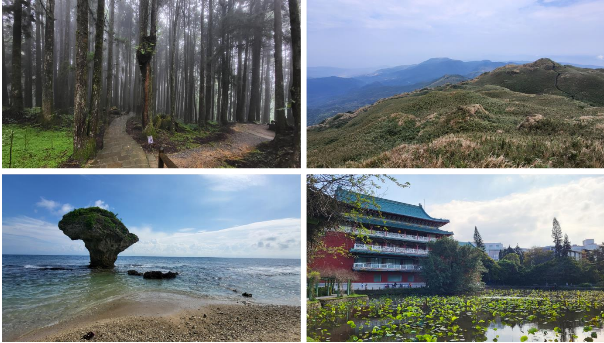
Figure 3: The beautiful nature of Taiwan. (Top left) Trees in the Alishan Forest Recreation Area. (Top right) View from Mount Qixing in Yangmingshan. (Bottom left) A rock formation on Xiaoliuqiu. (Bottom right) The lotus pond at the botanical garden.