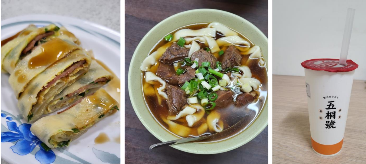
Figure 2: Examples of Taiwanese food. (Left) Dàn bǐng (egg pancakes). (Middle) Niú ròu miàn (beef noodle soup). (Right) Bubble tea.