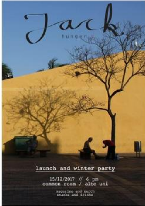
no. 3 11 winter 2017 / 2018